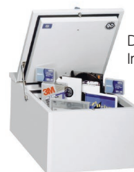
Data protection Insert FSDPI08

Optional Extras Available Key lock on each drawer REDL2 Electronic Lock & Key Lock Fingerprint lock Data Protection Insert Safe Alarm