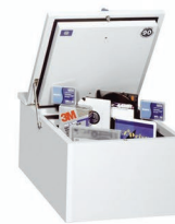
Optional Data Protection Insert FSDPI09